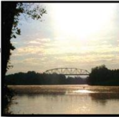
Below are views of County.