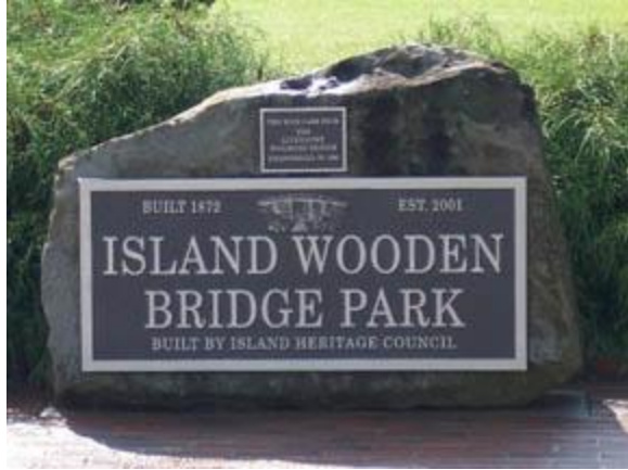
Historic Marker of Island Wooden Bridge Park commemorating the wooden bridge built in 1872.