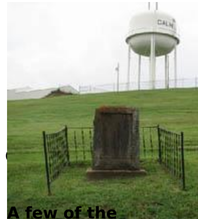
A few of the Sacramento Civil War