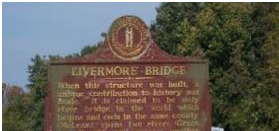
Historic Marker on the outskirts of Livermore - Livermore Bridge