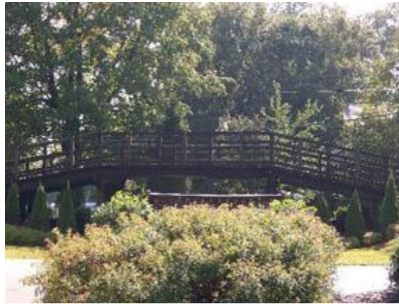
Island Wood Bridge, c. 1872

location of the first Court Case in the C