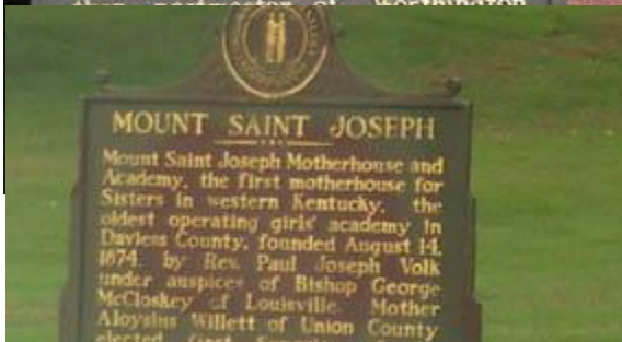
Historic Marker on Mount Saint Joseph the McLean/Davies