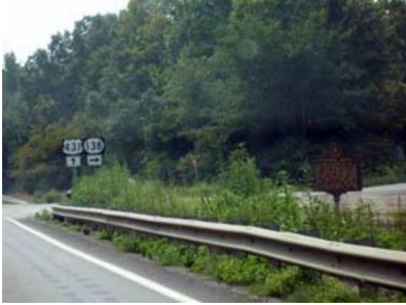
Historic Marker located at intersection of Hwy 431 and Hwy 138.