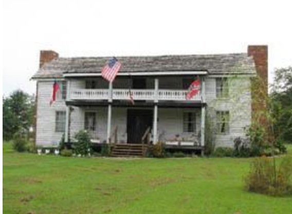
Original house from the battlefield of Sacramento.