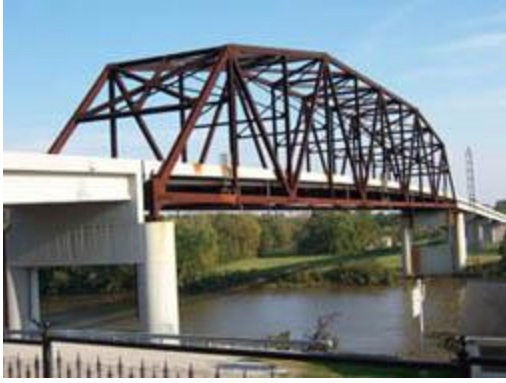
Another view of the Veteran's Memorial Bridge that crosses the Green River at Calhoun and Rumsey.