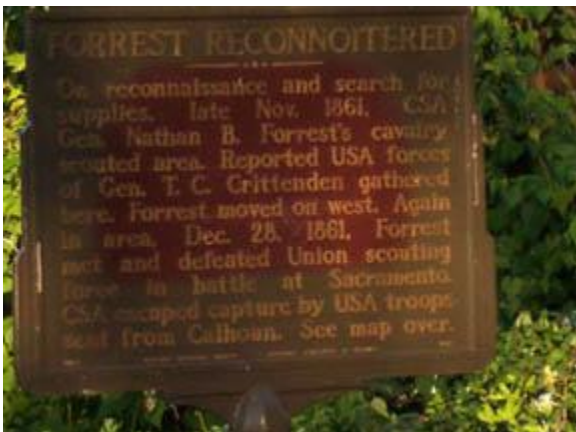
Nathan Bedford Forrest Reconnoitered Historic Marker