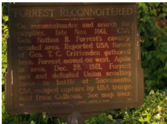
Nathan Bedford Forrest Reconnoitered Historic Marker