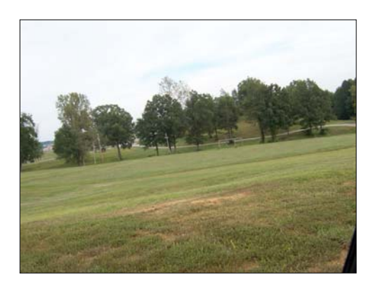
Location for hole # 5